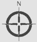
1290 Sft 2BHK | West