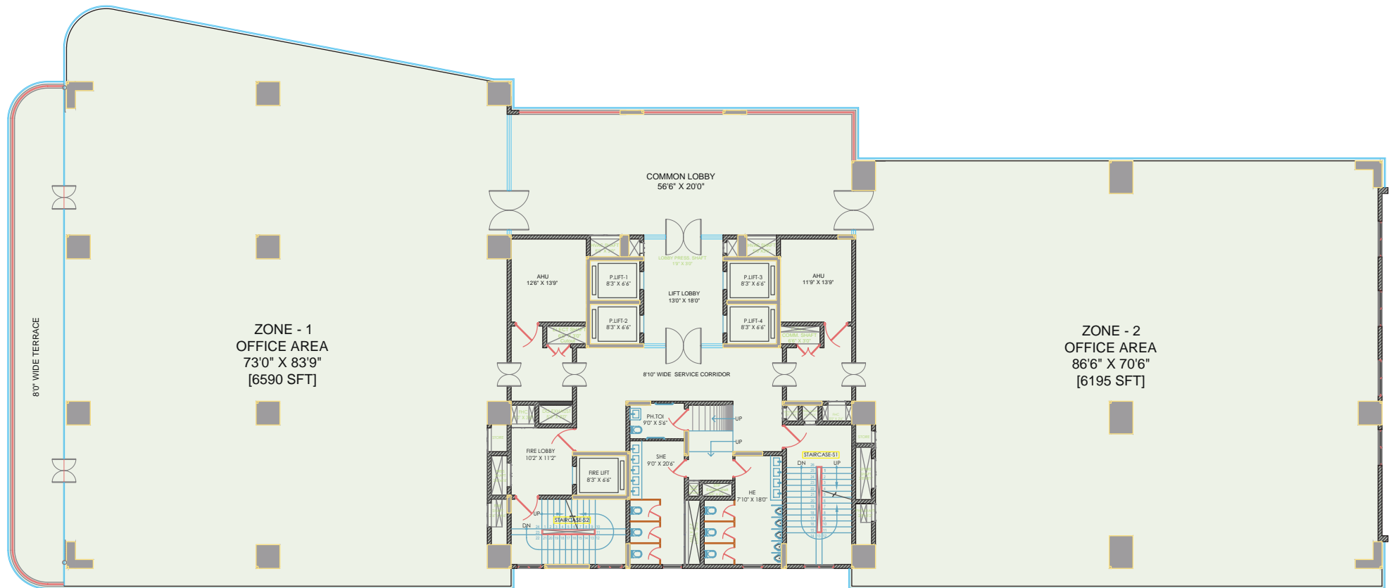
1 ST - 12 TH FLOOR PLAN