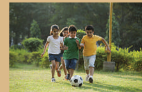
Childrens Play Area