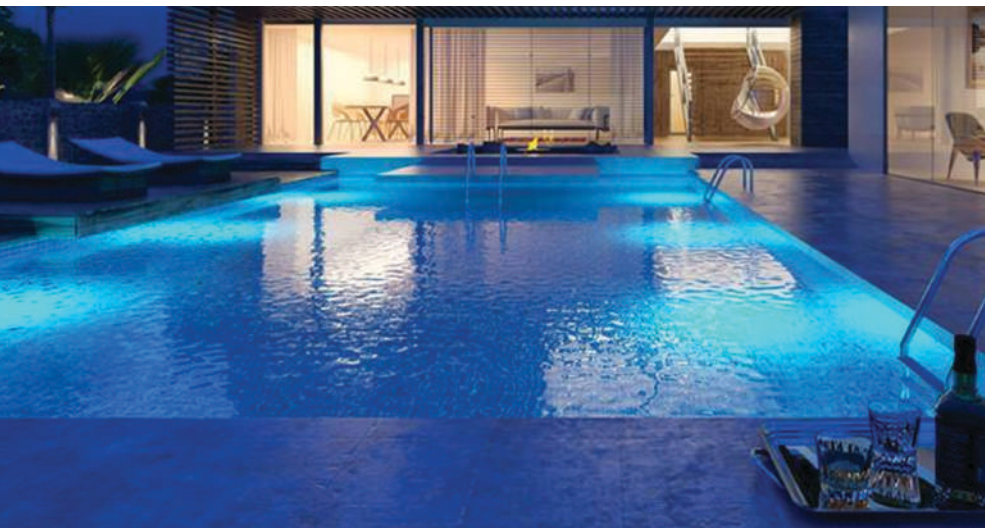
Clubhouse & Swimming Pool