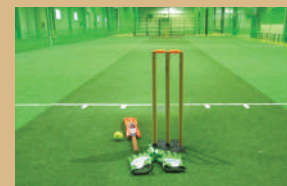
Cricket Practice Nets